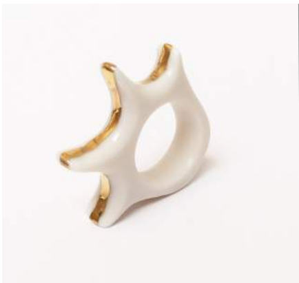
Midnight sun ring €229