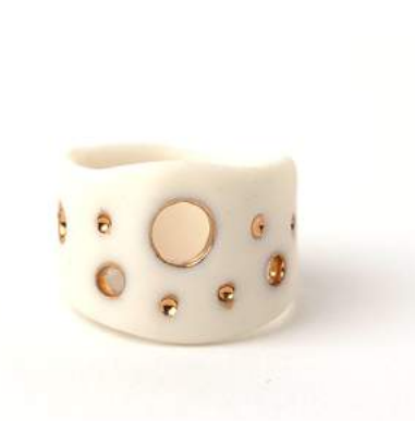
Bubbles ring €159