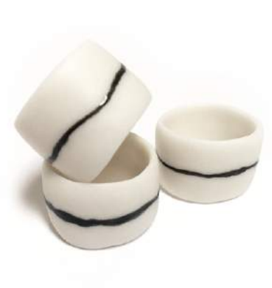
Coast line ring €119